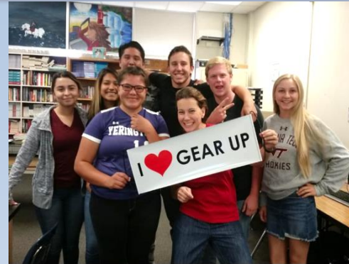
Yerington High School showing their love for GEAR UP 10/2018

Nevada GEAR UP's mission is to help all GEAR UP students transition smoothly to college by collaborating with higher education in providing students with the necessary supports and information to ensure students are knowledgeable and prepared.